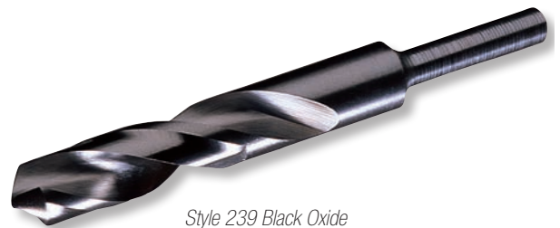
Style 239 Black Oxide